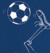
to play football