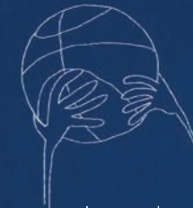
to play basketball