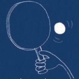
to play table tennis