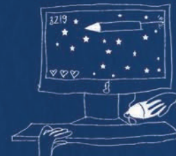
to play computer