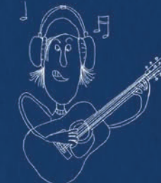
to play/listen to music