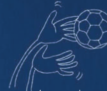
to play handball