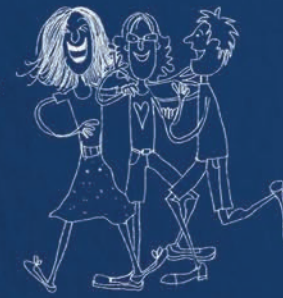
to be with friends